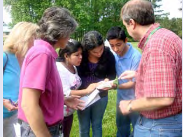
Students participating in the East Lee Middle School e-Mentoring program take a field trip. Organized by Communities In Schools, a United Way partner agency, e-Mentoring pairs ESL students with IBM employees who communicate electronically, providing students with practical guidance and an opportunity to enhance their writing and technology skills.

Years the United Way has served Lee County. (Yes, 2010 marks our golden anniversary.)