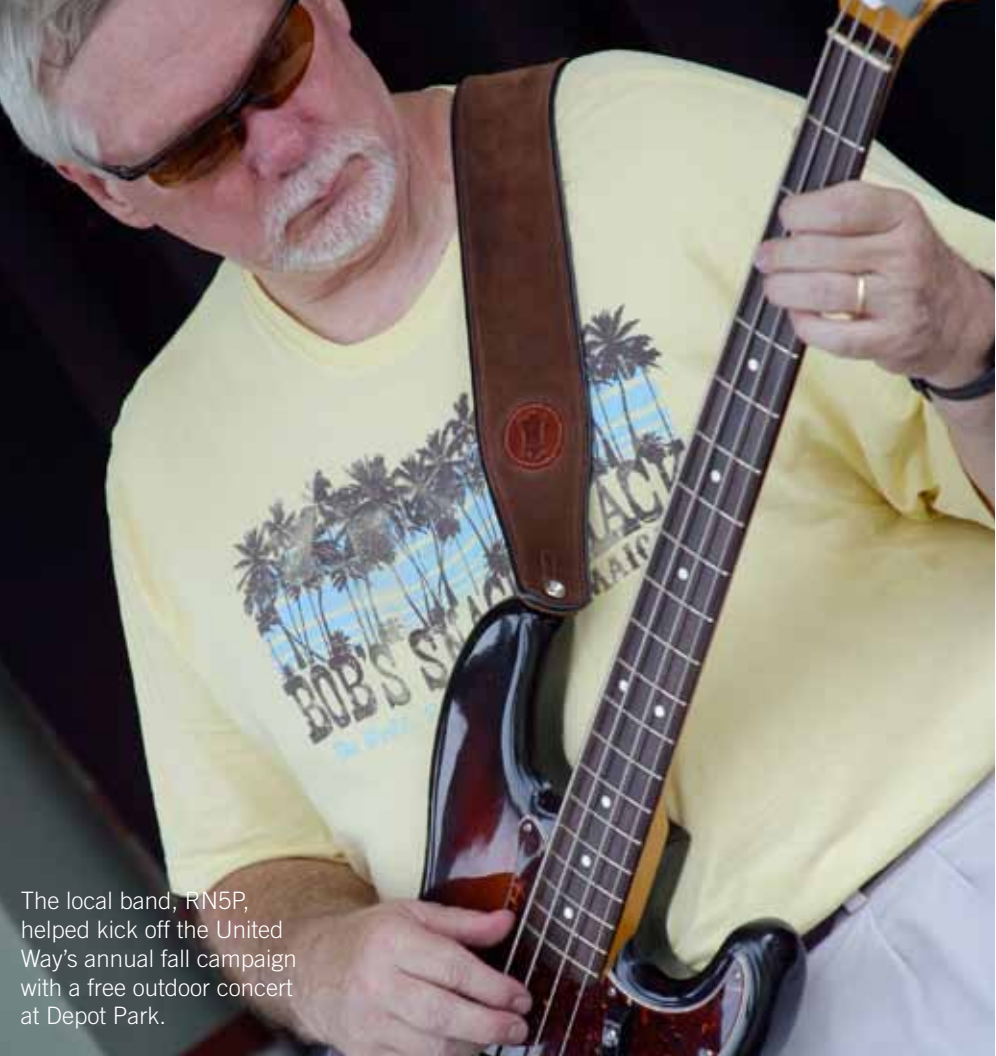
The local band, RN5P, helped kick off the United Way's annual fall campaign with a free outdoor concert at Depot Park.